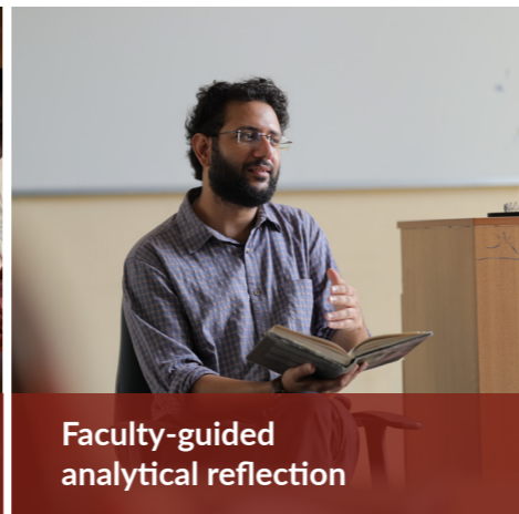
Faculty-guided analytical reflection

It ensures theory is tested within institutional realities.