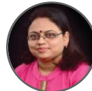
Dr. Ritu Karidhal Srivastava Senior Scientist, ISRO